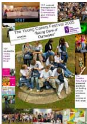
The Young Carers Festival Posters