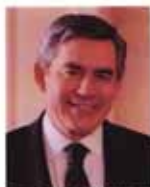
THE PRIME MINISTER